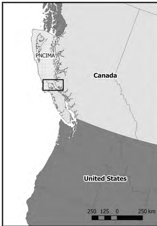
Figure 2. Location of the illustration-study region, the Regional District of Mount Waddington, in British Columbia, Canada. Abbreviation: PNCIMA, Pacific North Coast Integrated Management Area.

Step 1: Obtain consent. Before beginning a project, and at various stages throughout the project, it is crucial for the research team to obtain and maintain consent to engage in research (Berg 2001). Identifying and measuring intangible values can be successful only when those with stakes in the decision context participate as collaborators throughout. Researchers involved in such endeavors can coproduce relevant knowledge only when they are invited. Good research practice goes beyond the standards of informed consent (see, e.g., AAA 2009) to respect the diversity and variability