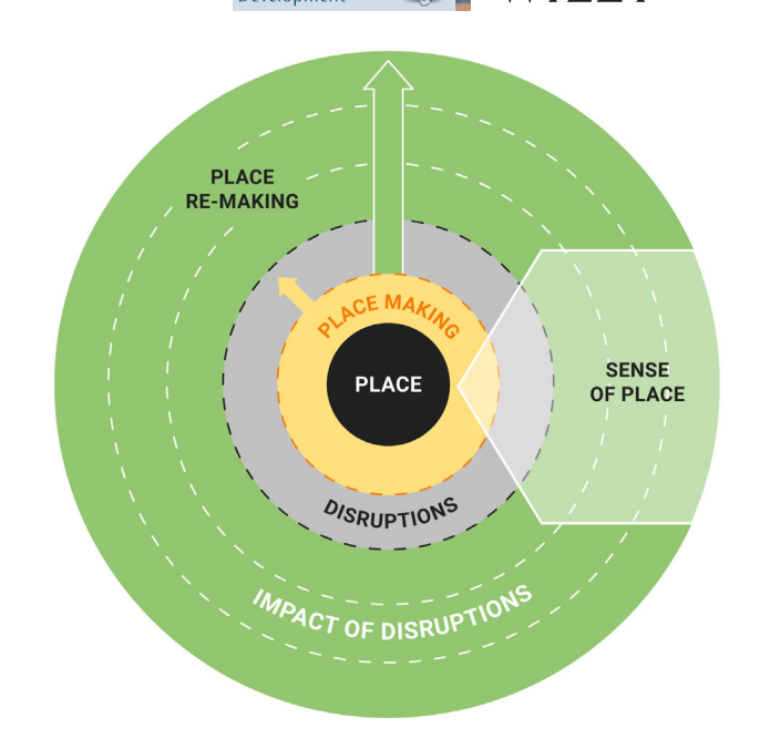
FIGURE 1 The relationships between the concepts of place, place making, place-remaking, and sense of place in the context of disruptions and their long-lasting impacts. [Colour figure can be viewed at wileyonlinelibrary.com]

In our approach, we understand sense of place as a concept fully shaped by individuals' perceptions and expressions of the place, and we conceptualize sense of place as a dynamic system of predictors and components. We differentiate three sense of place components: (i) people's feelings about the place, (ii) their activities related to the place, and (iii) place characteristics as perceived by people. These components are interconnected and tied up together with three predictors: person (socio-demographic characteristics), process (experience and preferences) and place (quarry) to work in a dynamic system that we term a sense of place bundle. This conceptualization of sense of place in bundles of predictors and components is guided by our previous research and demonstrated by Svobodova et al. (2021).