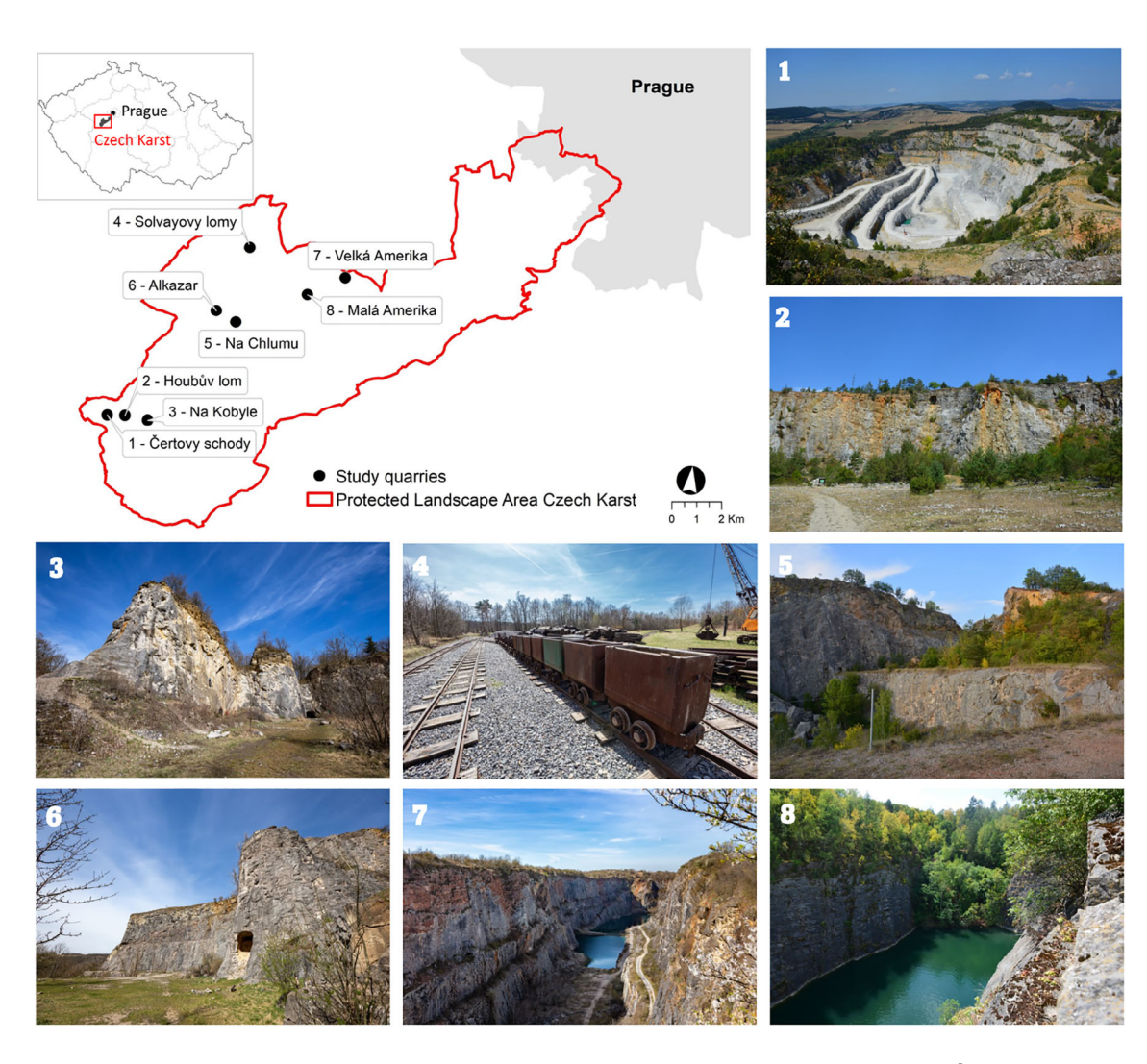
FIGURE 2 Study area of the Czech Karst and the eight quarries where the field data collection was conducted. [Colour figure can be viewed at wileyonlinelibrary.com]

The case study was designed using quantitative data collection. Target participants were visitors to the PLA Czech Karst who visited one of